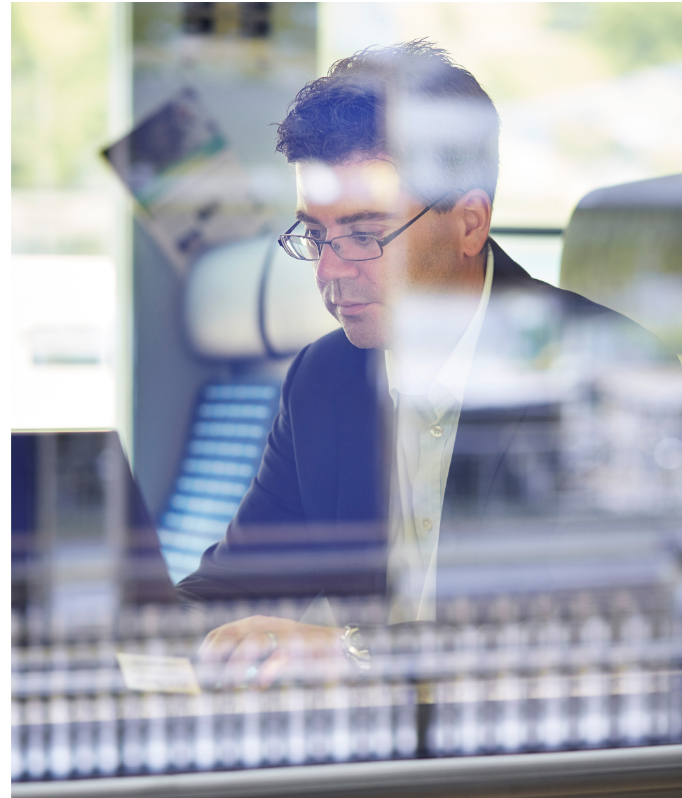
Case study A reliable power supply for Warsaw's second metro line Click here to reveal

Sustainable transportation solutions make up an important part of ABB's extensive portfolio of clean, energy-efficient technologies. We have worked particularly hard in recent years to expand our position as one of the world's leading providers of EV fast-charging stations, with more than 6,000 chargers installed in 57 countries. As just one example, ABB's charging systems are now being deployed in a growing network of stations along Germany's motorways. The company's car chargers can be found in